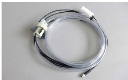
Tank level control 1005098