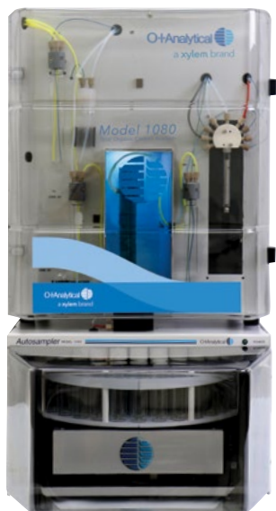
1080 TOC Analyzer